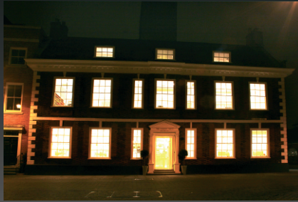
The Sailor's Rest • 2 St Peter's Street • Ipswich • Suffolk